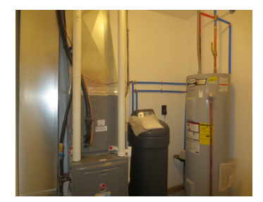
Sharp new construction! Be the first owner of this brand new duplex! Affordable & Convenient living.

Visit: www.meyerrealtystpaul.com • E-mail: meyerrealtystpaul@gmail.com Call/text: 308.750.4514